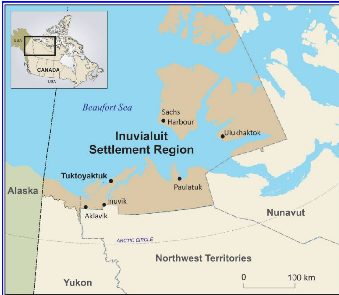
Fig. 1. Location of Tuktoyaktuk within the Inuvialuit Settlement Region.

Niryutait MPA (see Fig. 2) that covers two other areas in the Mackenzie River Estuary (Harwood et al. 2014).