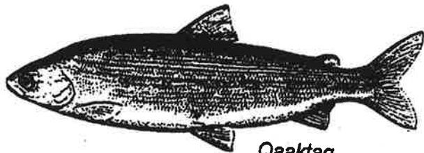
Arctic cisco ( Coregonus autumnalis ) Qaaktaq

Roots = Masu Wild Rhubarb = Quṇulliq Wild Spinach (Sour Dock) = Quagaq Wild Potatoe = Aigaaq Willow Leaves = Akutuqpalik Hudson's Bay Tea = Tilaaqiq