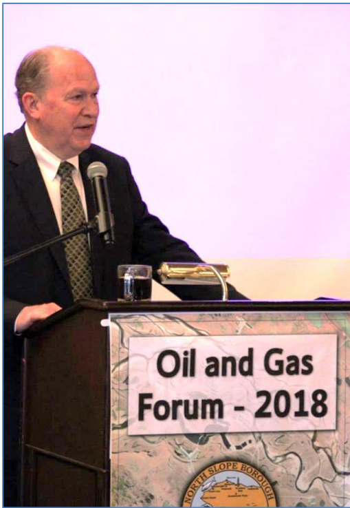
Alaska Governor Bill Walker

The North Slope Borough (NSB or Borough) sponsored the 2018 Oil and Gas Forum on June 14 in Anchorage. The forum focused on five topics: Summary of accomplishments since the 2016 forum, update on state and federal lease sales, agency planning efforts on the North Slope, planned revisions to