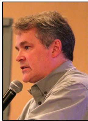
DNR Commissioner Andy Mack

Commissioner Mack noted that once again, activity is increasing in the region, including new exploration and production, new interest in a gas line and planning for a lease sale in the 1002 area of ANWR. He emphasized the importance of the forum to encourage conversations and discussions. Commissioner Mack recognized